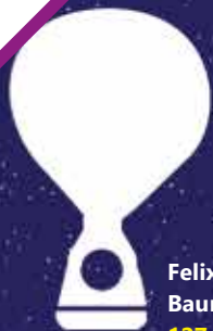
Felix Baumgartner 127,851 ft.