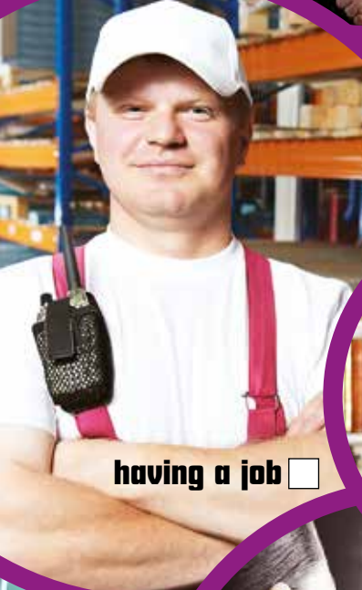
having a job