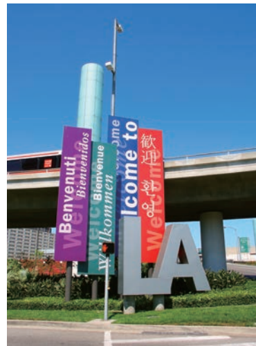
Banners greeting travelers to Los Angeles

ロサンゼルスは日本人とも関わりの深い街です。19世紀末、ロサンゼルス在住の日本人漁師による日本食店の開業が、リトルトーキョー発祥のきっかけとなりました。リトルトーキョーは、一時は30,000人を超えるほどの規模になりましたが、第二次世界大戦中、多くの日系人が強制収容所に入れられ、一時は消滅しました。戦後は再生し、映像で紹介されていたように様々な飲食店やイベントによって賑わいを取り戻しています。1992年に開館した全米日系人博物館では、戦前の日系人の生活の様子や強制収容所時代の遺物が展示され、彼らの歩みを後世に伝えています。