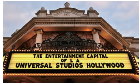
The Globe Theatre in Hollywood

Hollywood is the movie capital of the world. But this wasn't always the case. In fact, a series of events combined to make that happen. If any of the key moments in history 5 did not occur, people may never have heard of Hollywood and the famous song might have been "Hooray for Fort Lee, New Jersey!"