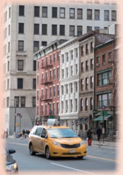
New York City